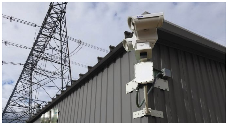
(top) In the event an intruder walks into the field of view of SpotterRF’s radar, radio waves bounce off the person and back to the radar, which then calculates the precise GPS location of the target and target size. The position information is then relayed to SpotterRF’s NetworkedIO server. (bottom) To maximize performance of the radar-thermal solution, VTI worked closely with support and development teams from SpotterRF and FLIR, as well as VMS provider Verint.

back to the radar, which then calculates the precise GPS location of the target and target size and relays that position information to SpotterRF’s NetworkedIO server.